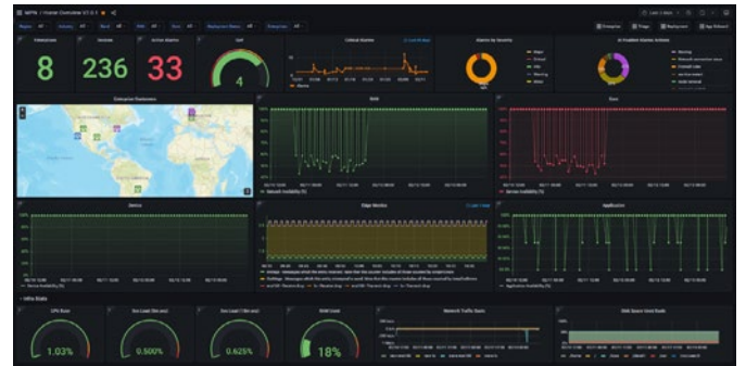
Mobile Private Network End-to-End Management Portal

Our services span business planning and network design to network and service operations. Complemented by our deployment workflow automation and mobile private network end-to-end management portal, this allows us to provide comprehensive management capabilities for effective network operations.